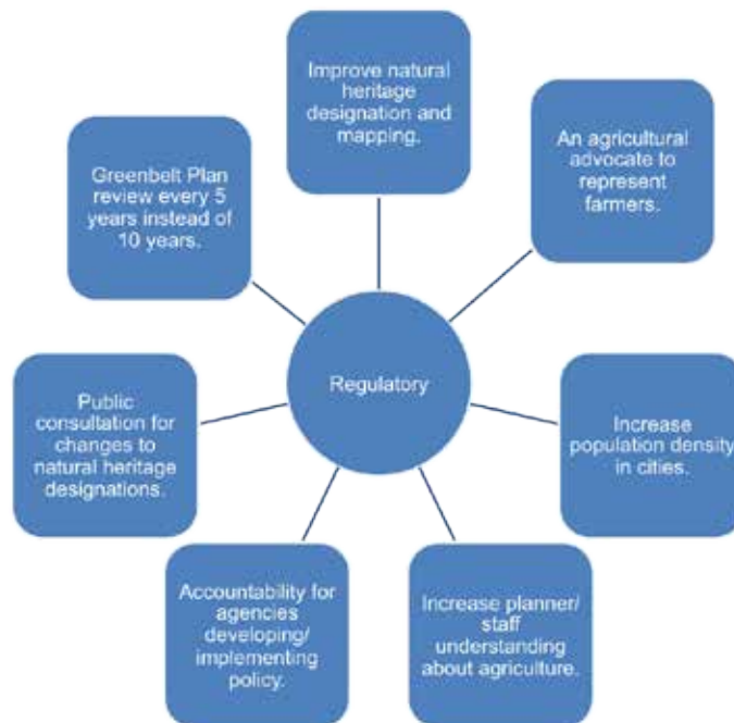
Figure 3: Suggestions for Improvement from an Economic Perspective

Protecting the land by protecting the farmers was one theme that came out strongly throughout the consultation process with farmers. Agricultural viability is a challenge across the province in most sectors and is a challenge not easily surmounted. Farmers in the Greenbelt do have the