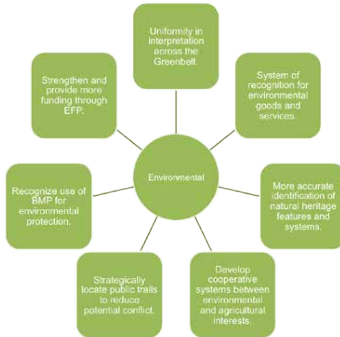
Figure 2: Suggestions for Improvement from an Environmental Perspective

Many suggestions made by farmers were repeated throughout the FGDs and interviews. In general, most farmers feel they are good stewards of the land and that more flexibility in implementation