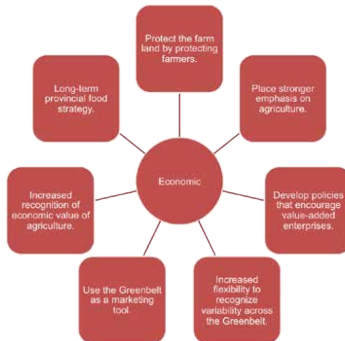
Figure 4: Suggestions for Improvement from a Regulatory Perspective

advantage of being located in close proximity to their market. In order to enhance their viability, they suggested policies that encourage value-added enterprises that enable them to capture the value of the near-urban setting. Using the Greenbelt as a marketing tool with its own brand was another suggestion, as was the development of a provincial food strategy. Farmers also felt that a higher recognition of the economic benefits provided by agriculture in this very unique region would help in the development and implementation of more effective policies.