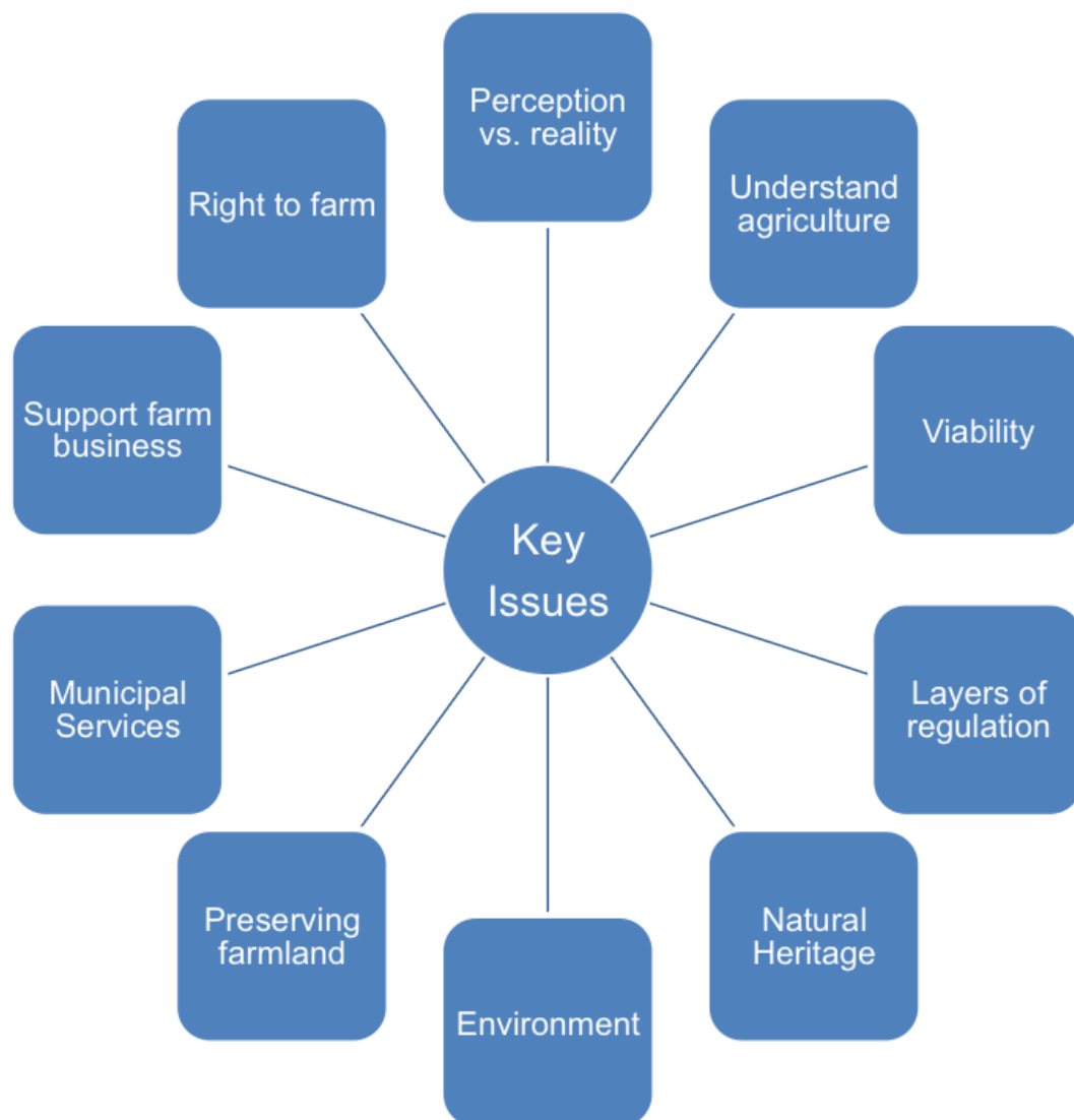
Figure 5: Key Issues - Agriculture and Planning in the Greenbelt – Planner Perspectives

Taken together, the results of the surveys, interviews, and workshops provide a comprehensive overview of planner perspectives on planning for agriculture within the Greenbelt. In general there is very strong support for the long-term interests of agriculture. Indeed many planners have a strong understanding of agriculture and work closely with the farm community to help move the industry forward. Having said this, planning deals with competing interests that at times can lead to conflict and differing perspectives. The planner input is summarized in Figure 5.